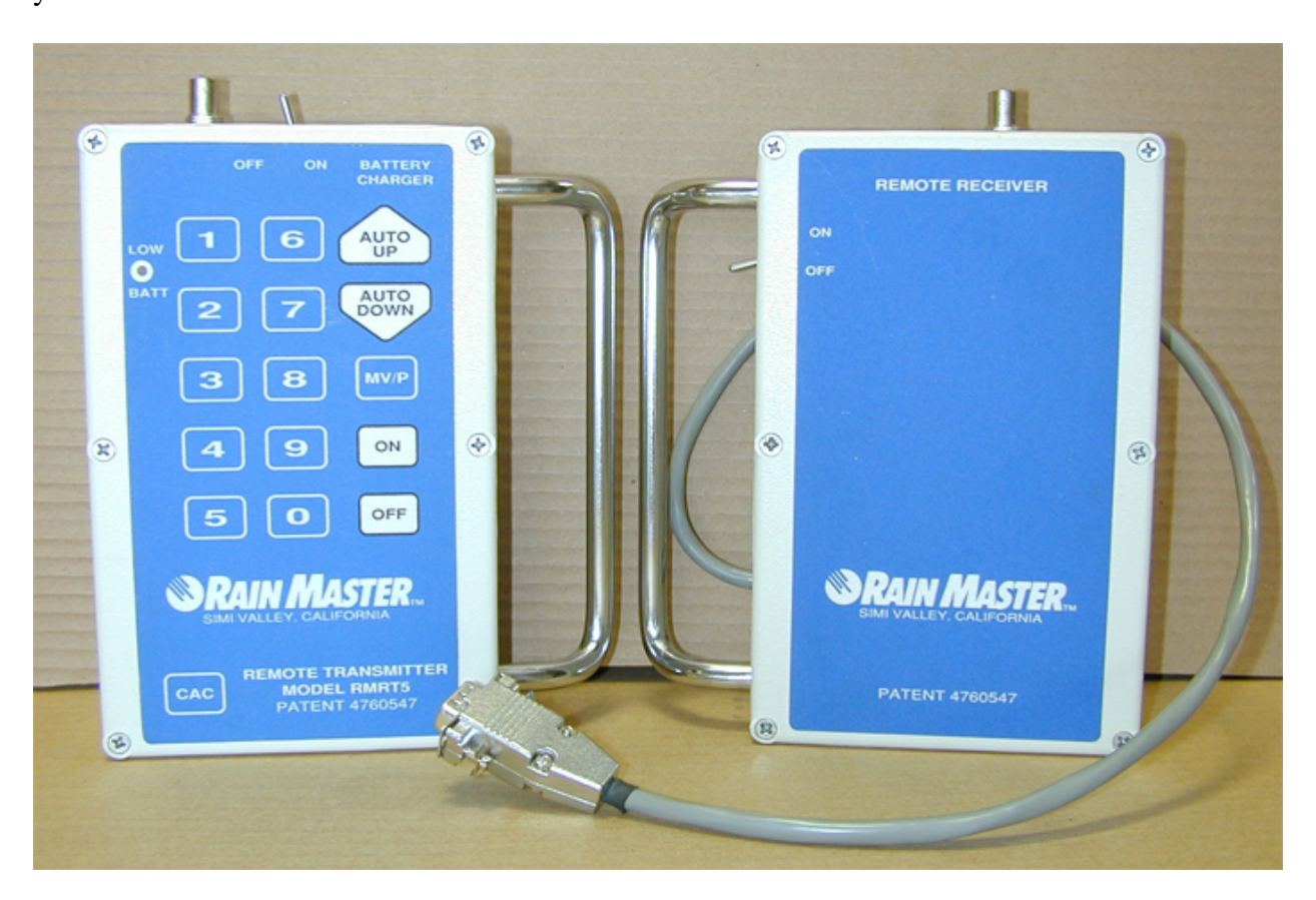
Figure 1: RT5 FM Remote Control System

To take full advantage of all the ways RT5 can help you do your job more efficiently and economically, please take a few minutes and read your User Manual. It won't be long before your best friend in the field is the RT5 .